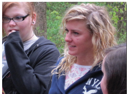
Our students have success in groups and as individuals.