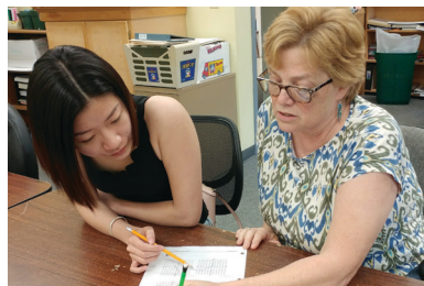
Small classes ensure the individual attention students need.

We offer FREE career and job search services and workshops, including the "Career Interest Inventory" to help assess skills and interests and match them with potential career paths.