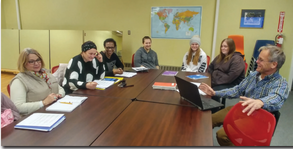
English language students enjoying class at the Saco Learning Center.