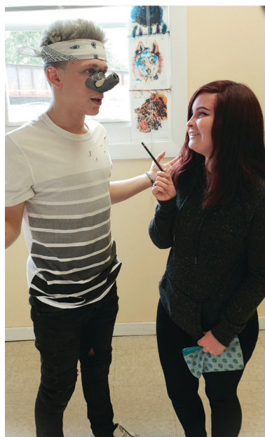
There are many approaches to learning.