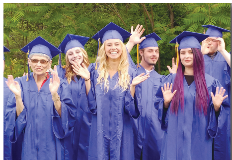
Adult Education graduates celebrate their success at their graduation ceremony.

Our FREE orientation sessions provide an overview of the HiSET and an opportunity to take practice tests to assess academic ability and place students in the appropriate classes when necessary. We have a variety of classes to improve your skills and help you pass the HiSET tests. Once the practice tests are passed, a student can be scheduled for the HiSET exam. You too CAN be one of our graduates!